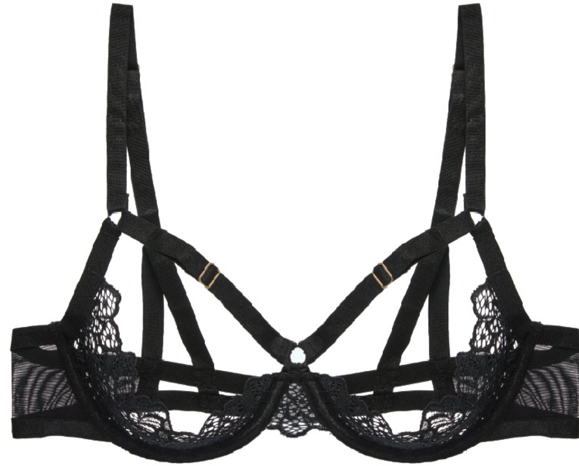
V59001 1/4 CUP UNDERWIRE