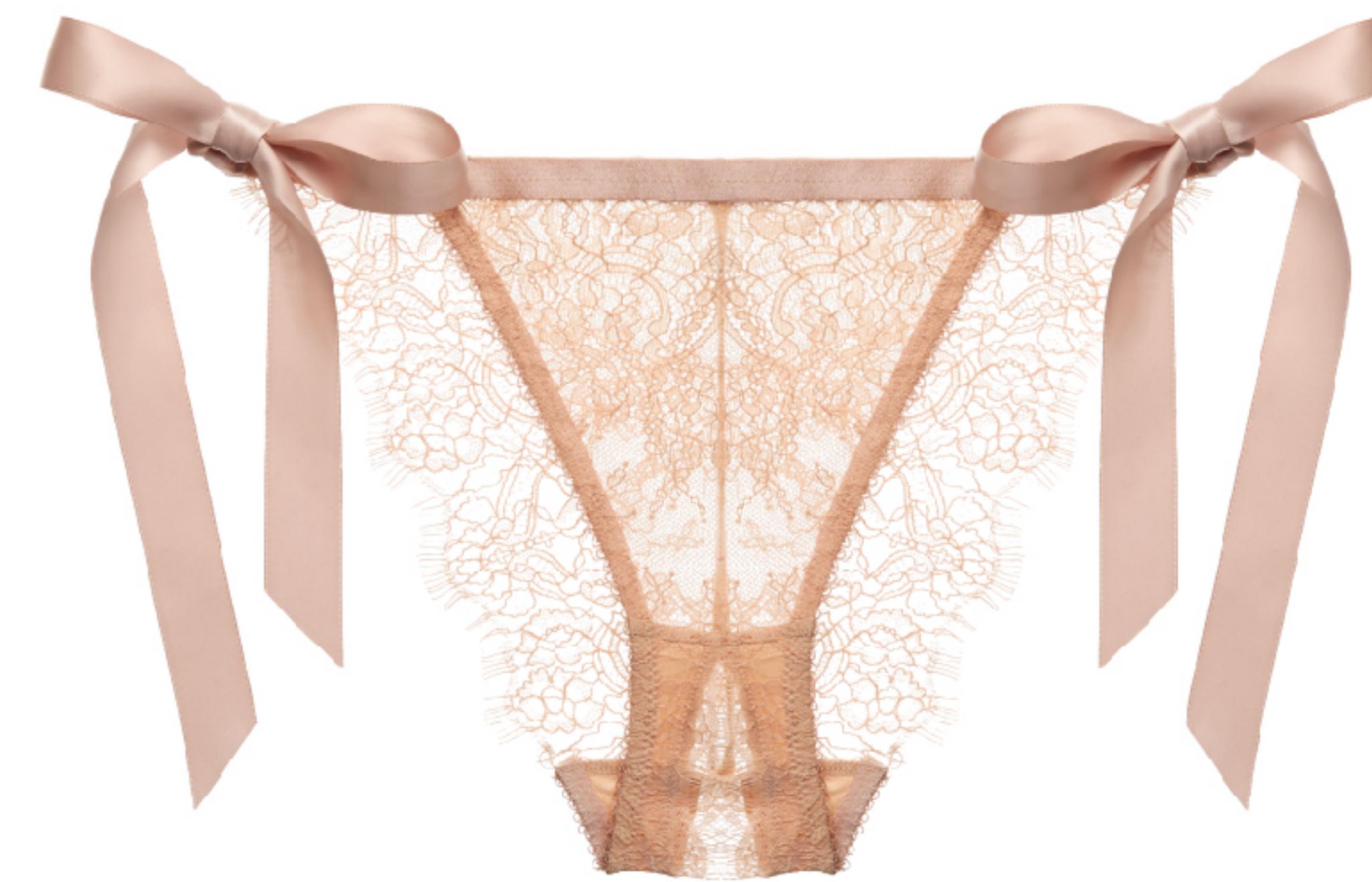
V22007 OPEN TIE SIDE BIKINI