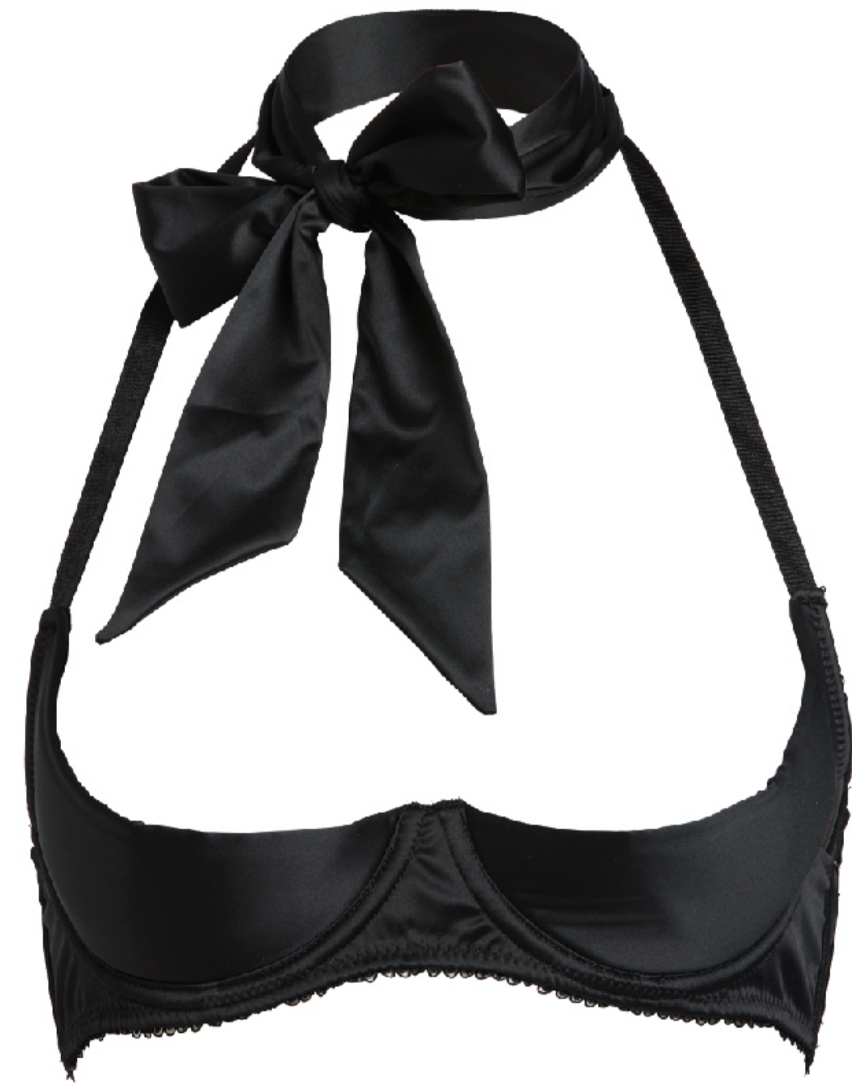
V59009 1/4 CUP UNDERWIRE BRA