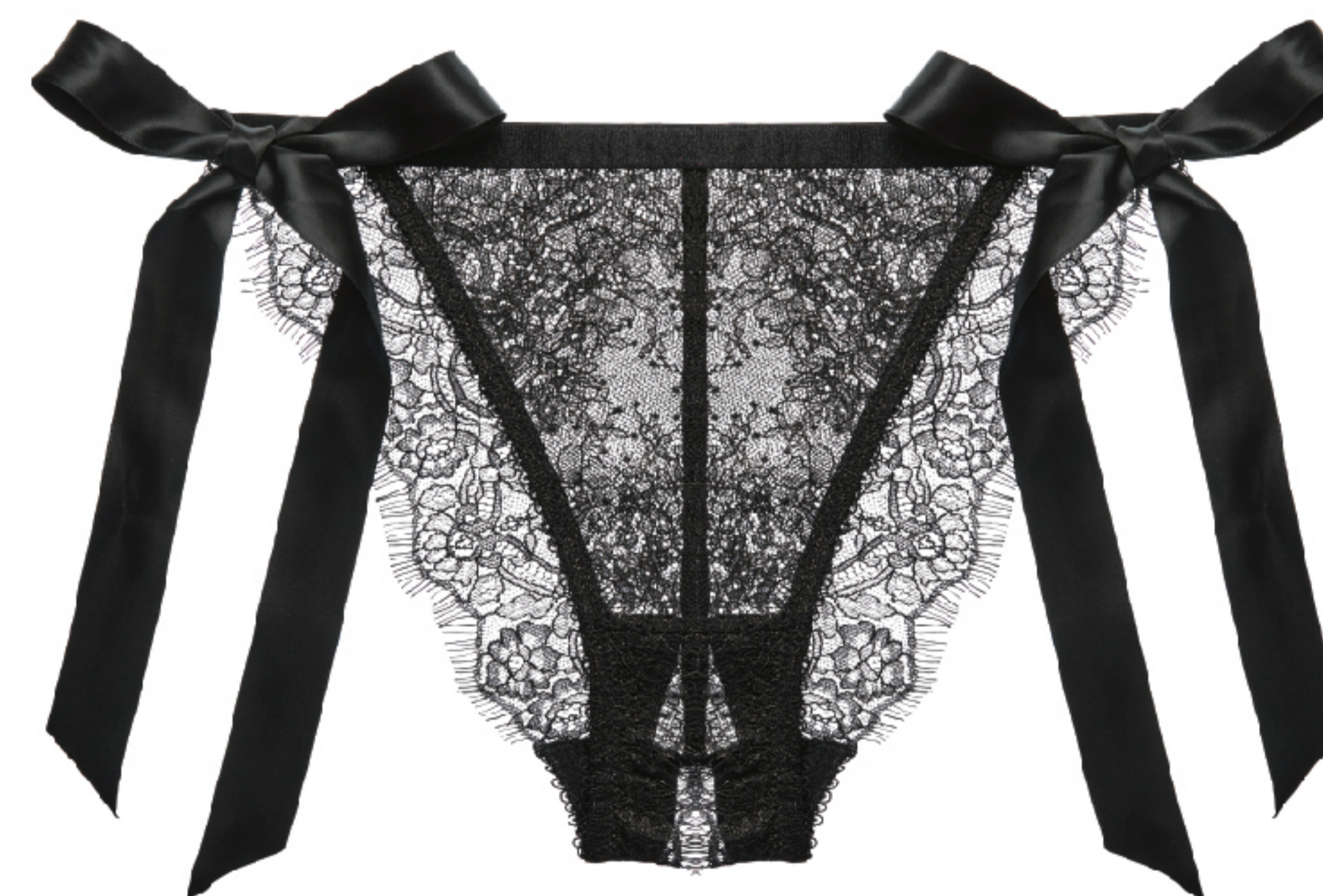
V22007 OPEN TIE SIDE BIKINI