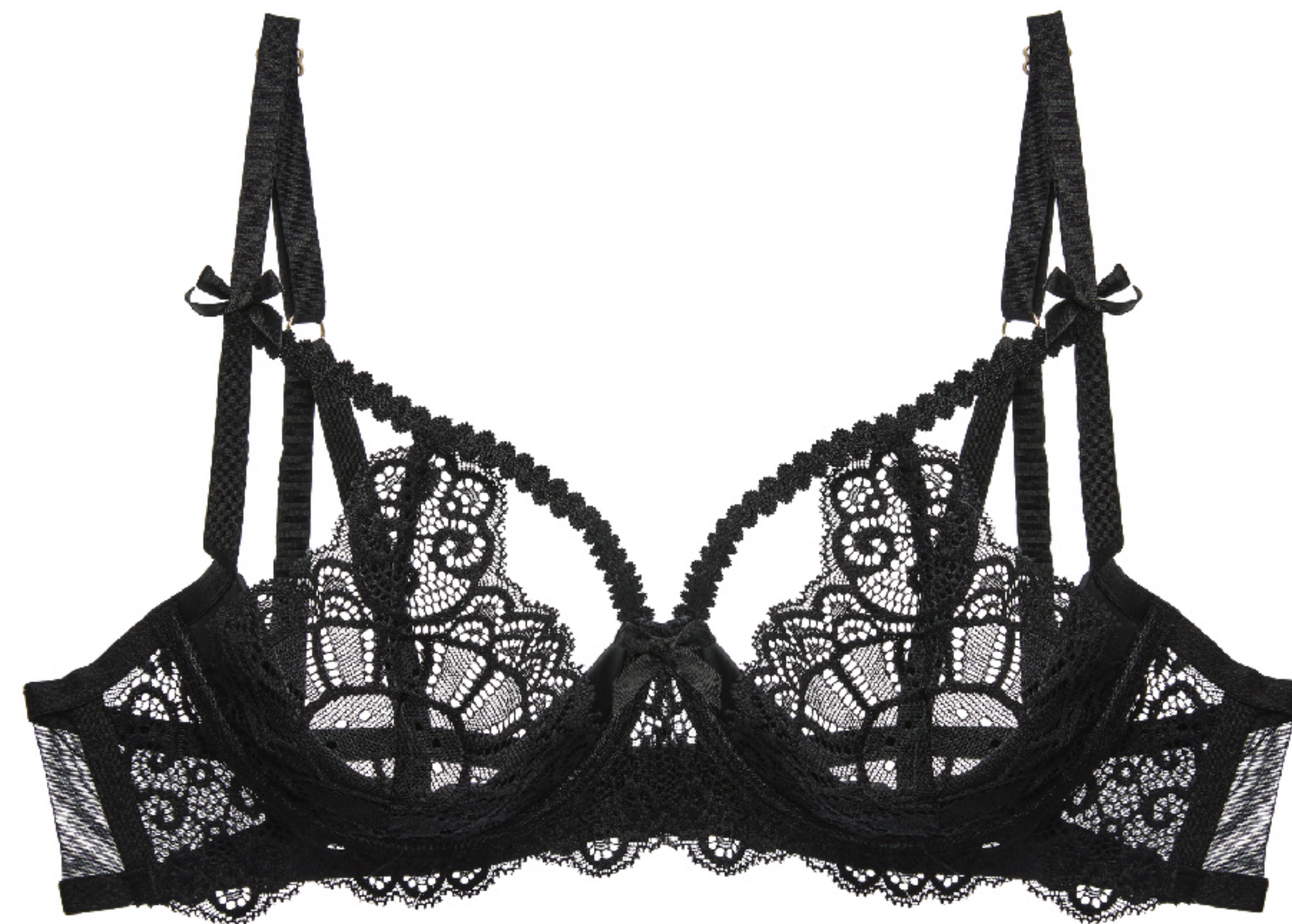
----- UNDERWIRE BRA