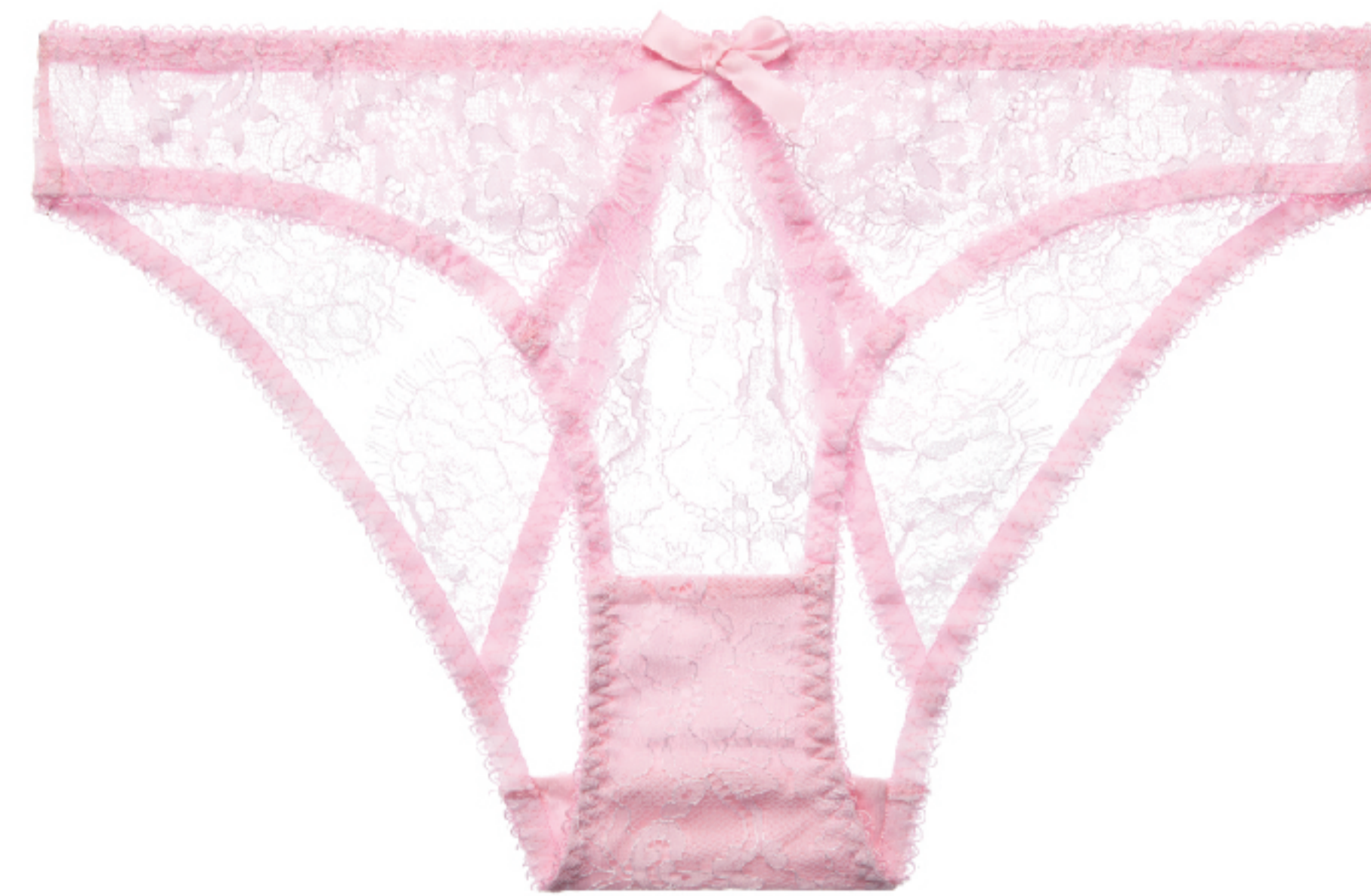
V22006 OPEN BACK BIKINI