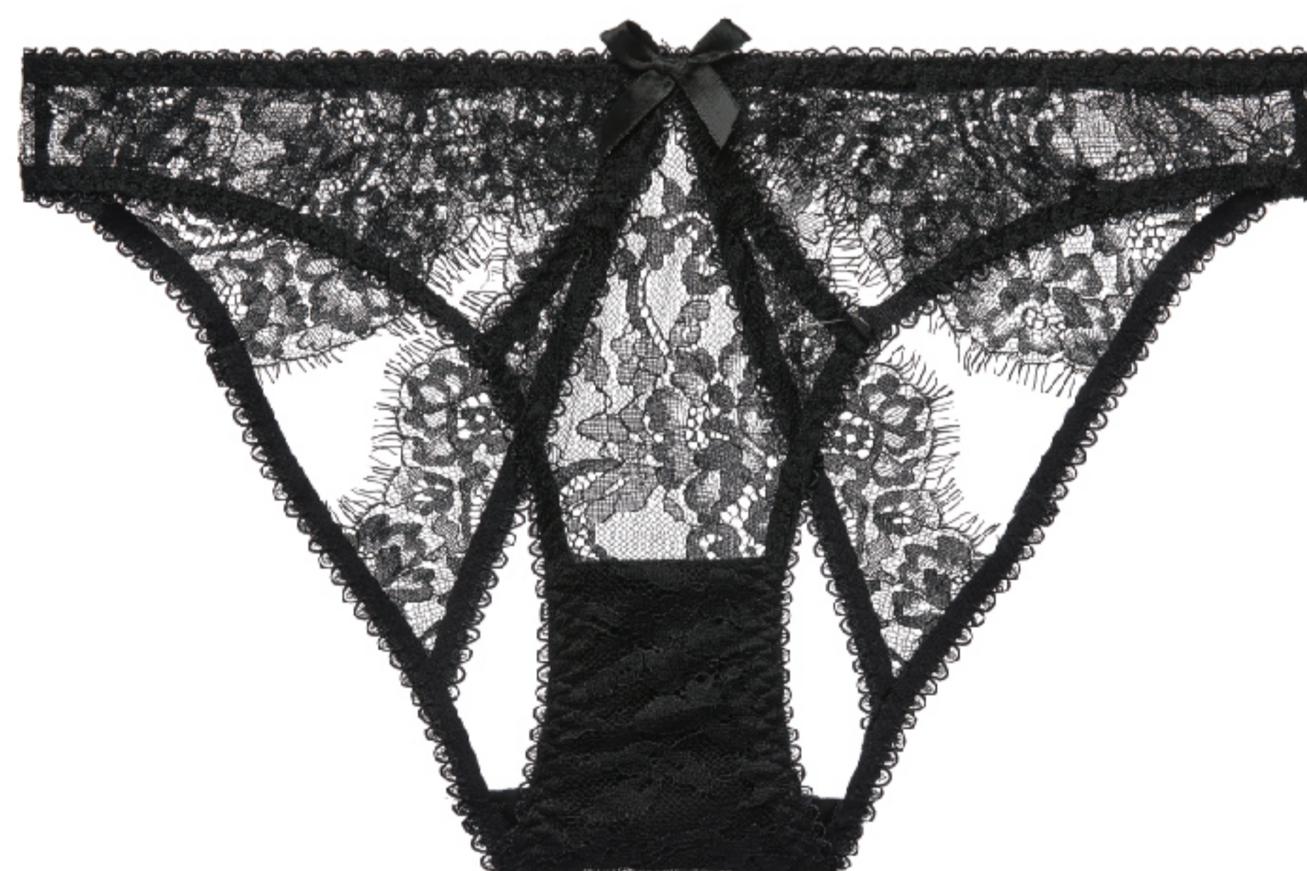
V22006 OPEN BACK BIKINI