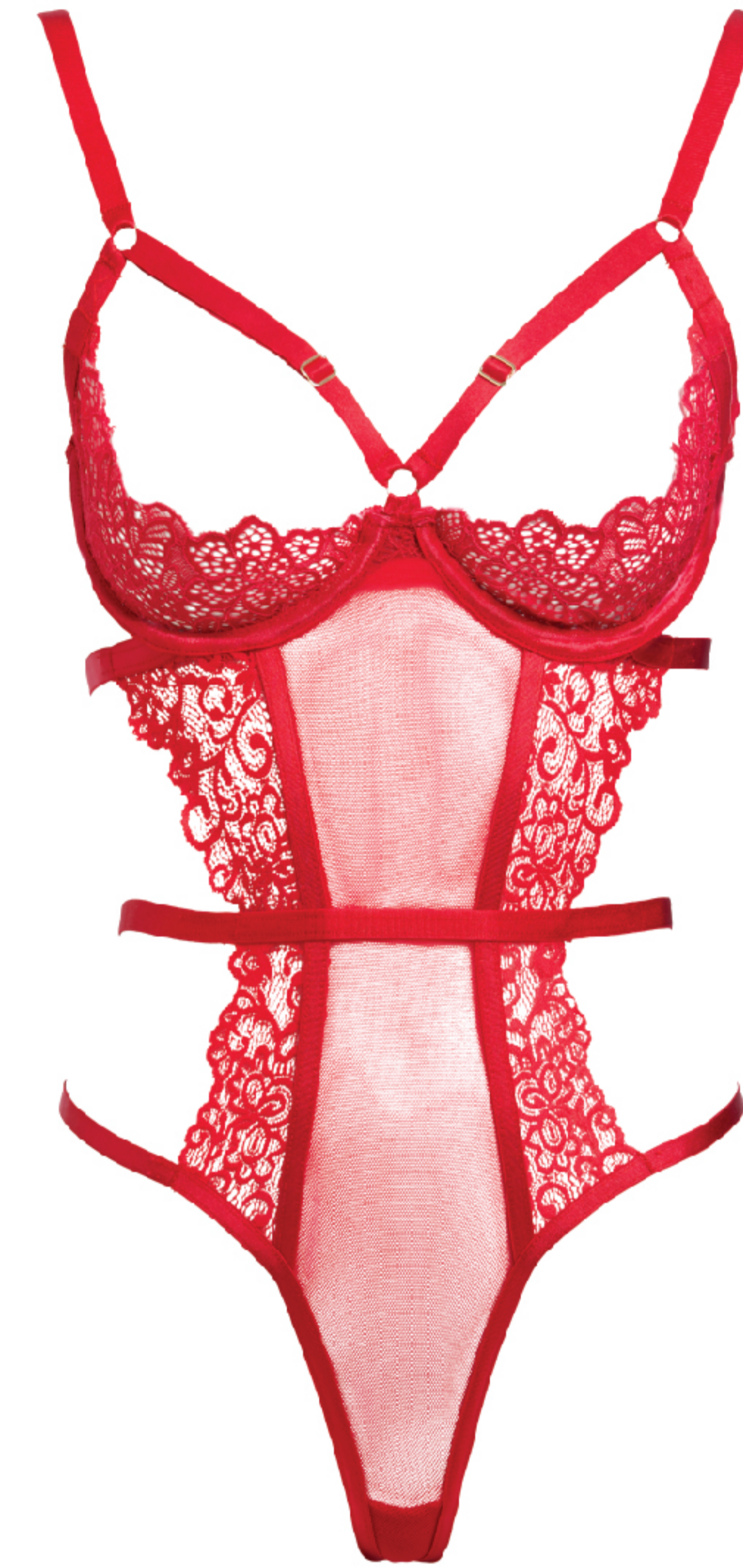
V48001 BODY SUIT