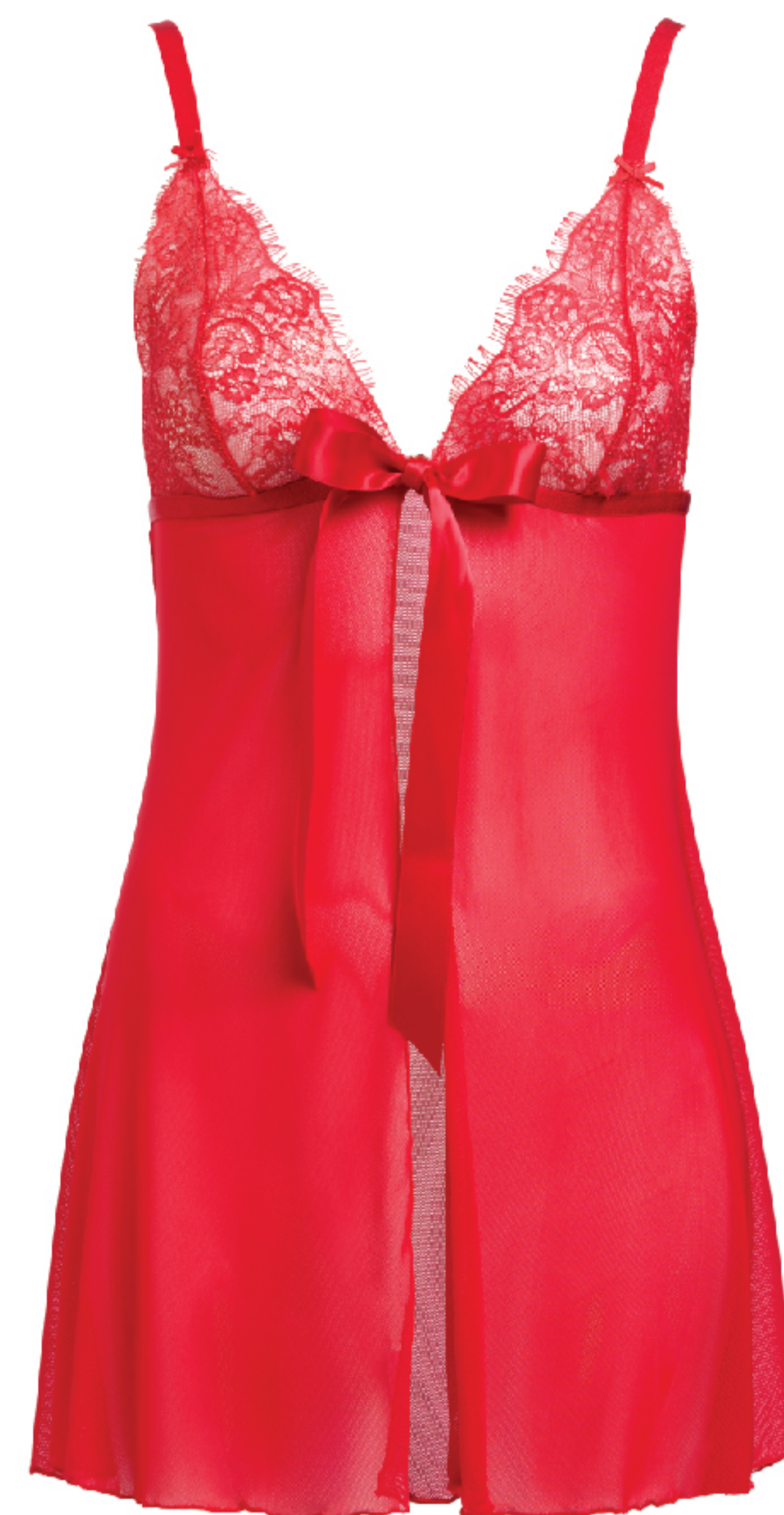
V32007 OPEN BABYDOLL