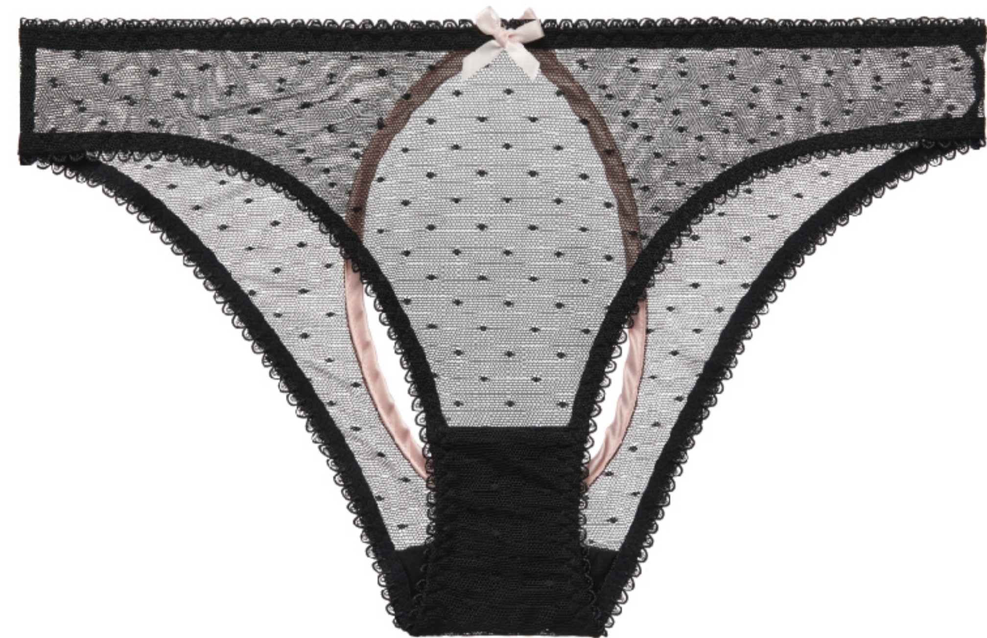
V22003 OPEN BACK BIKINI