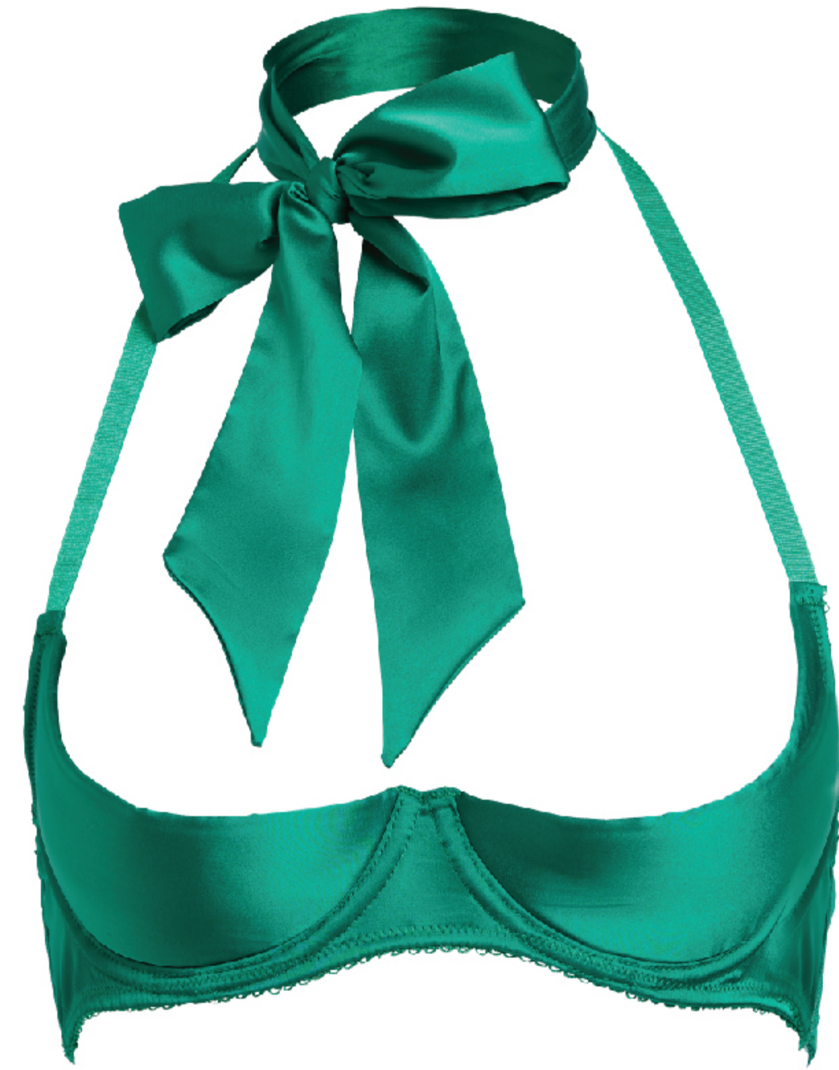
V59009 1/4 CUP UNDERWIRE BRA