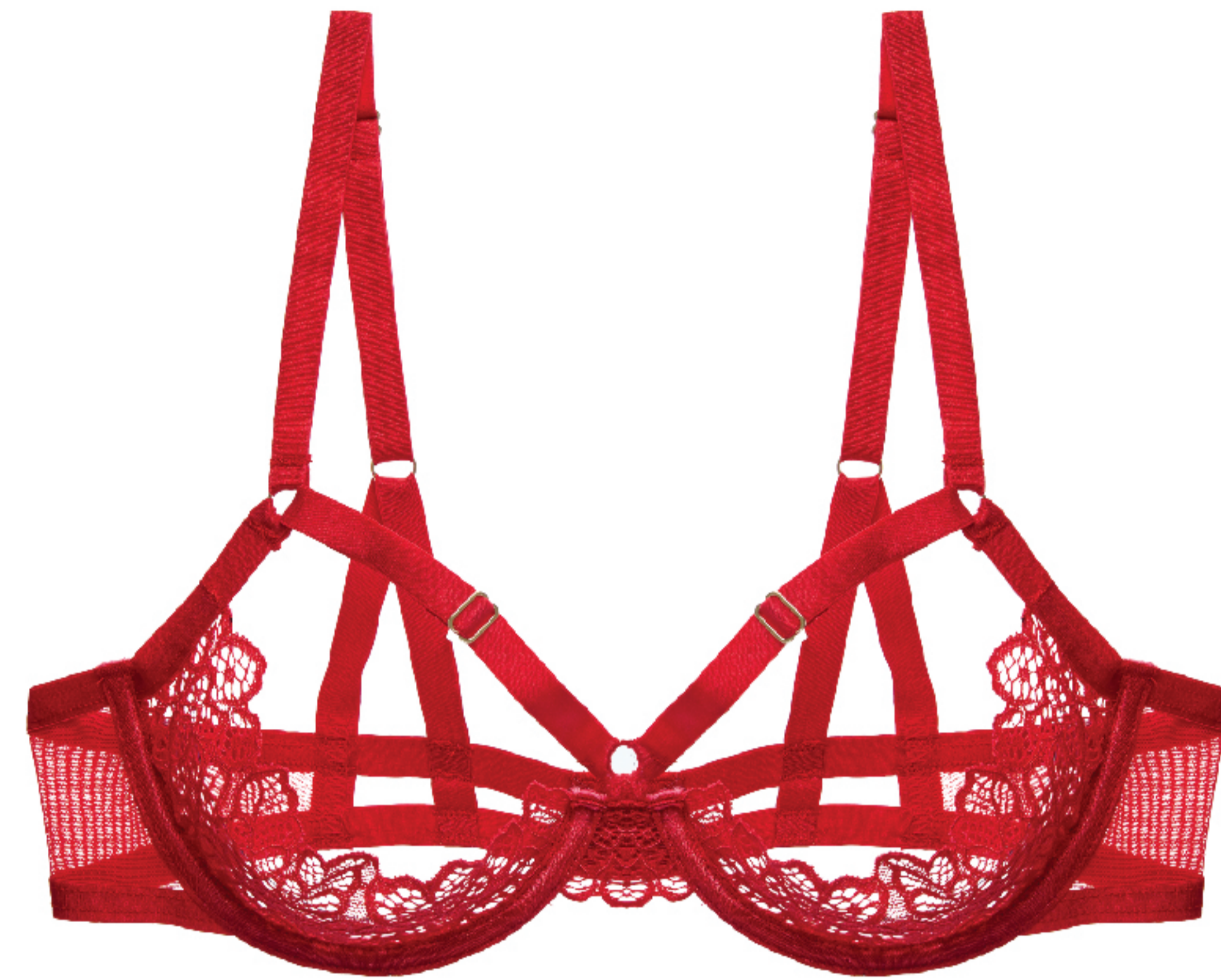
V59001 1/4 CUP UNDERWIRE