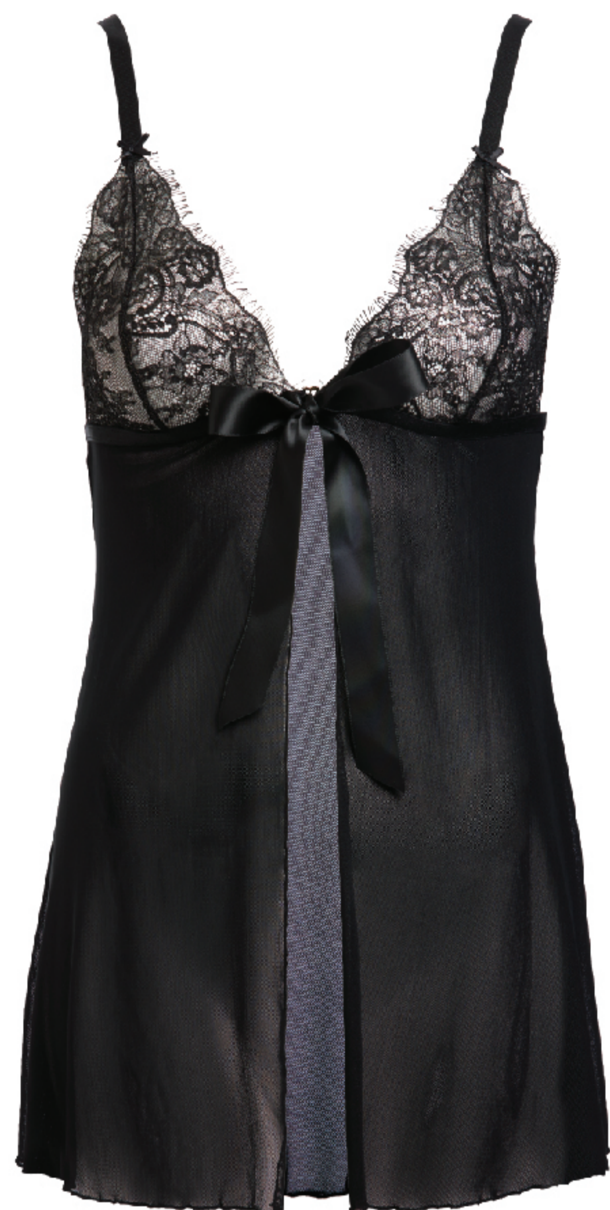
V32007 OPEN BABYDOLL