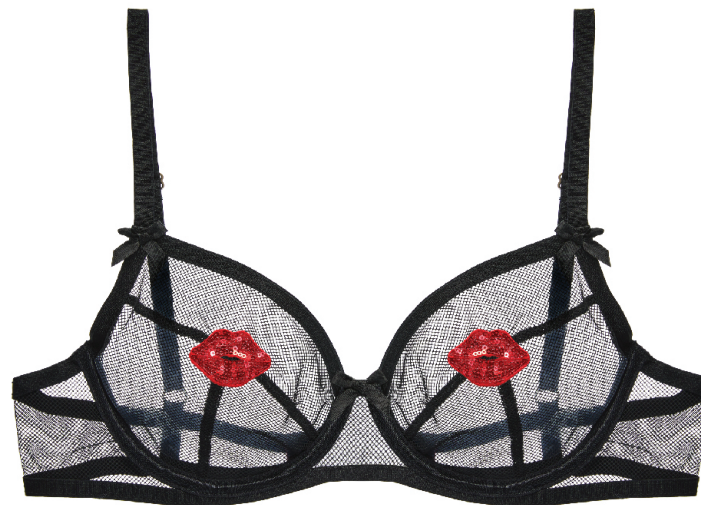
V59005 BALCONETTE BRA