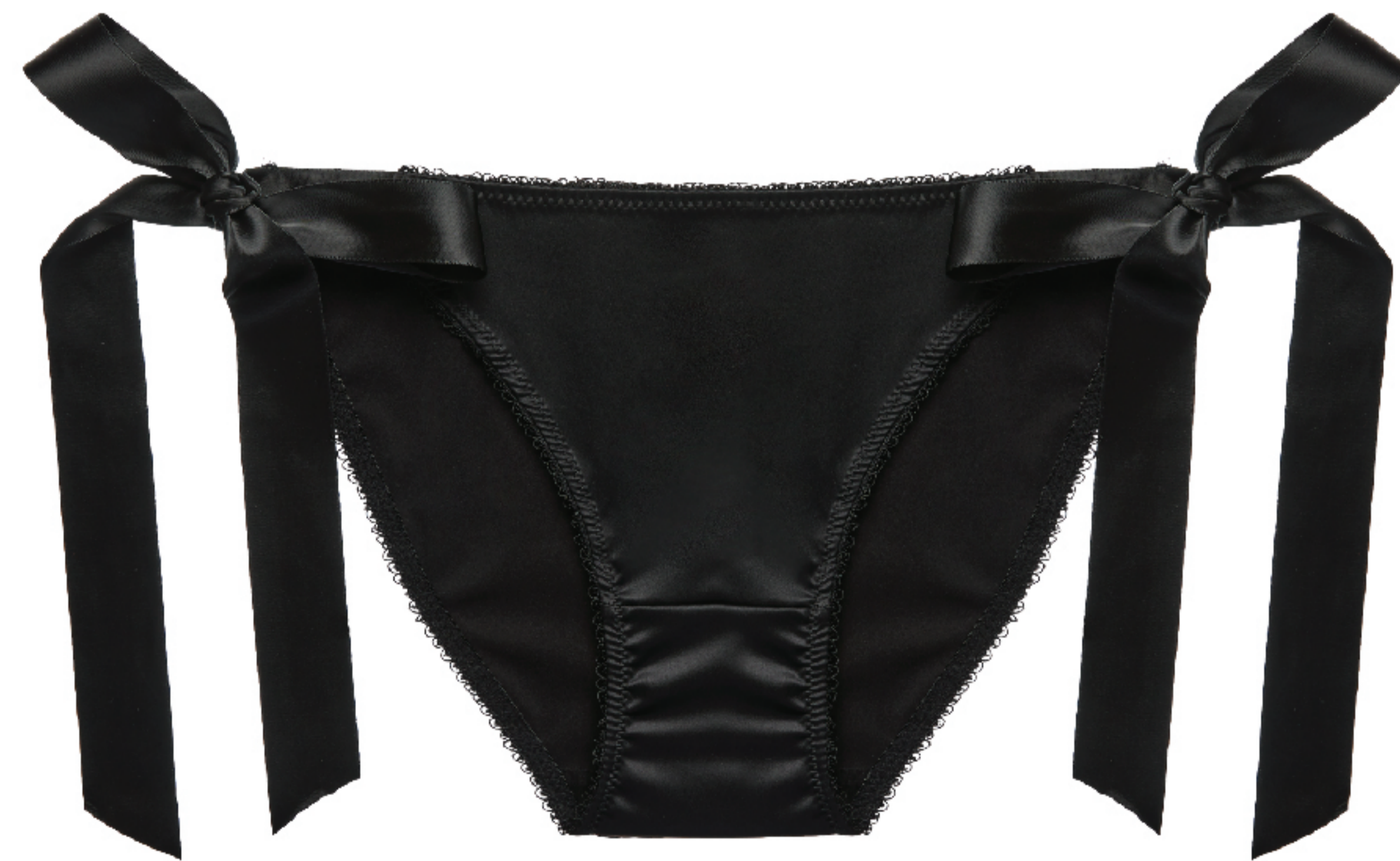
V22009 TIE SIDE TANGA