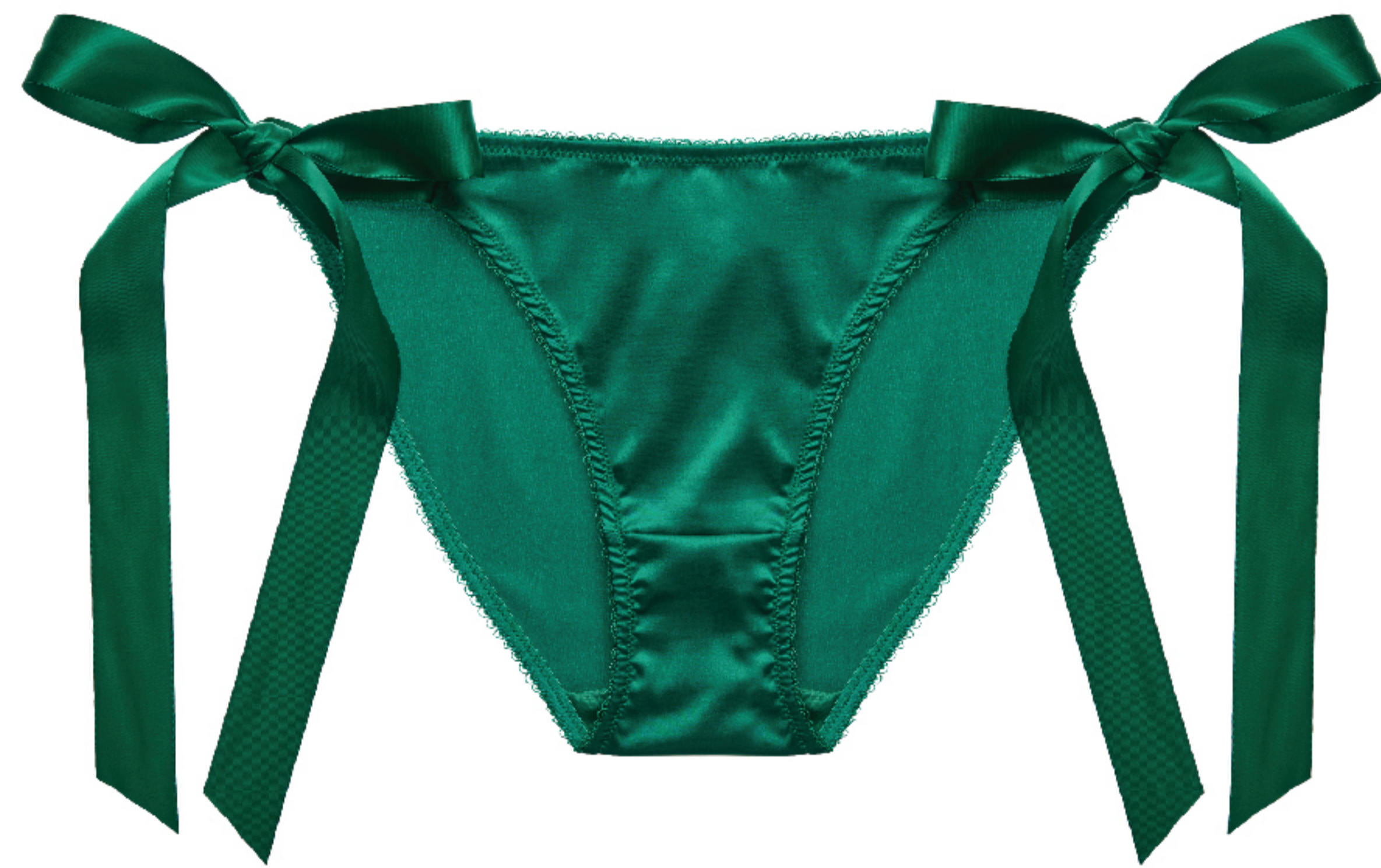
V22009 TIE SIDE TANGA