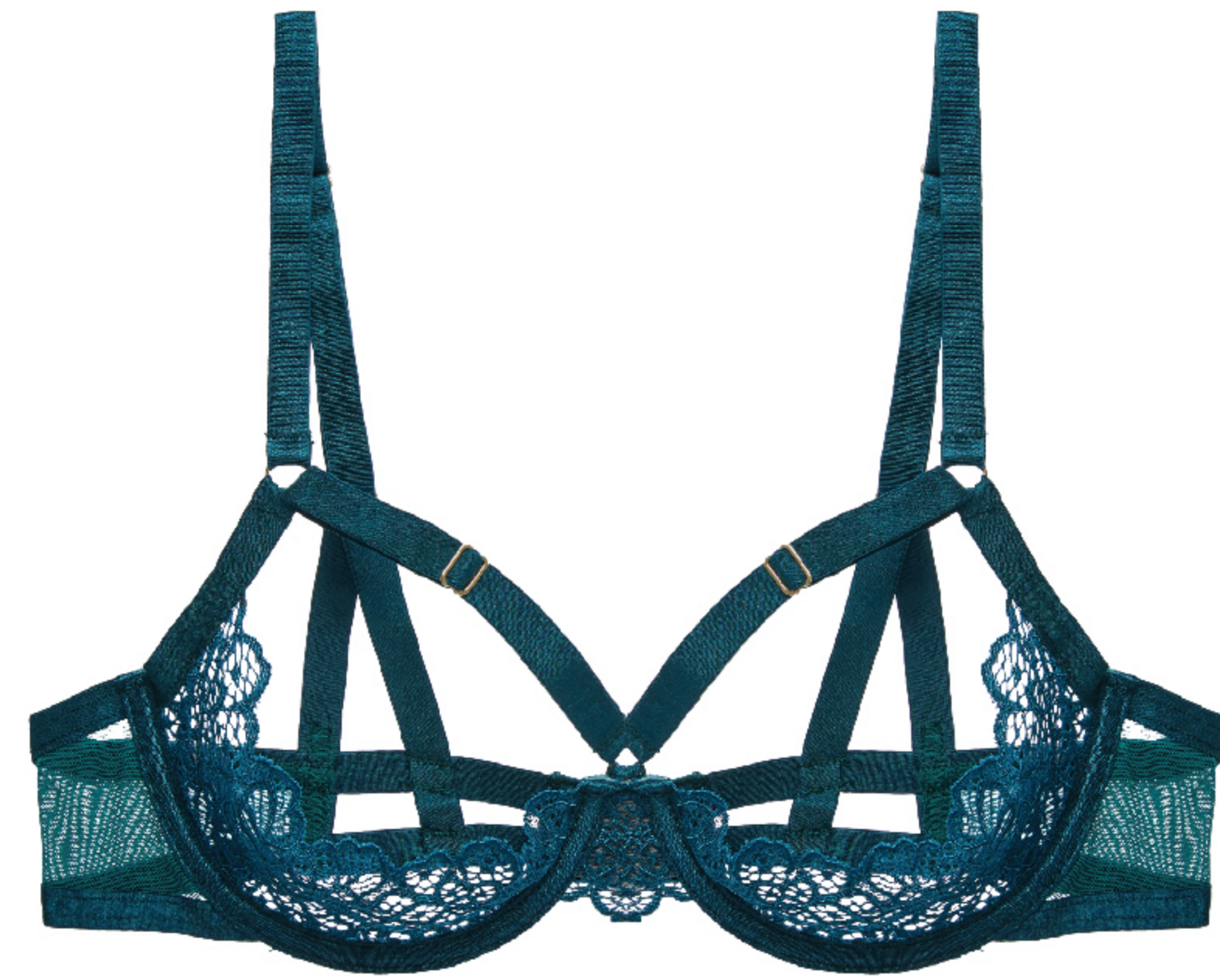
V59001 1/4 CUP UNDERWIRE