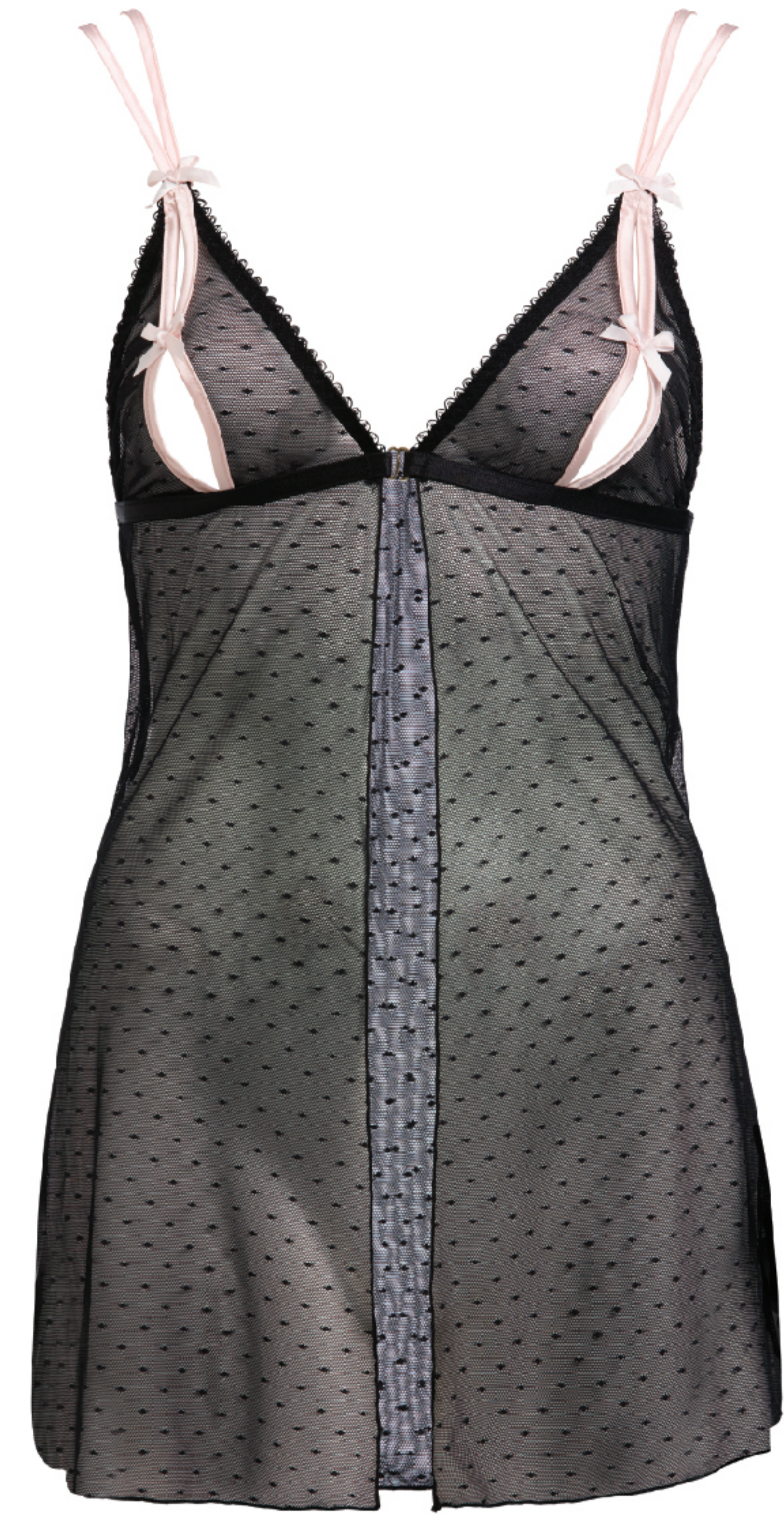
V32003 OPEN BABYDOLL