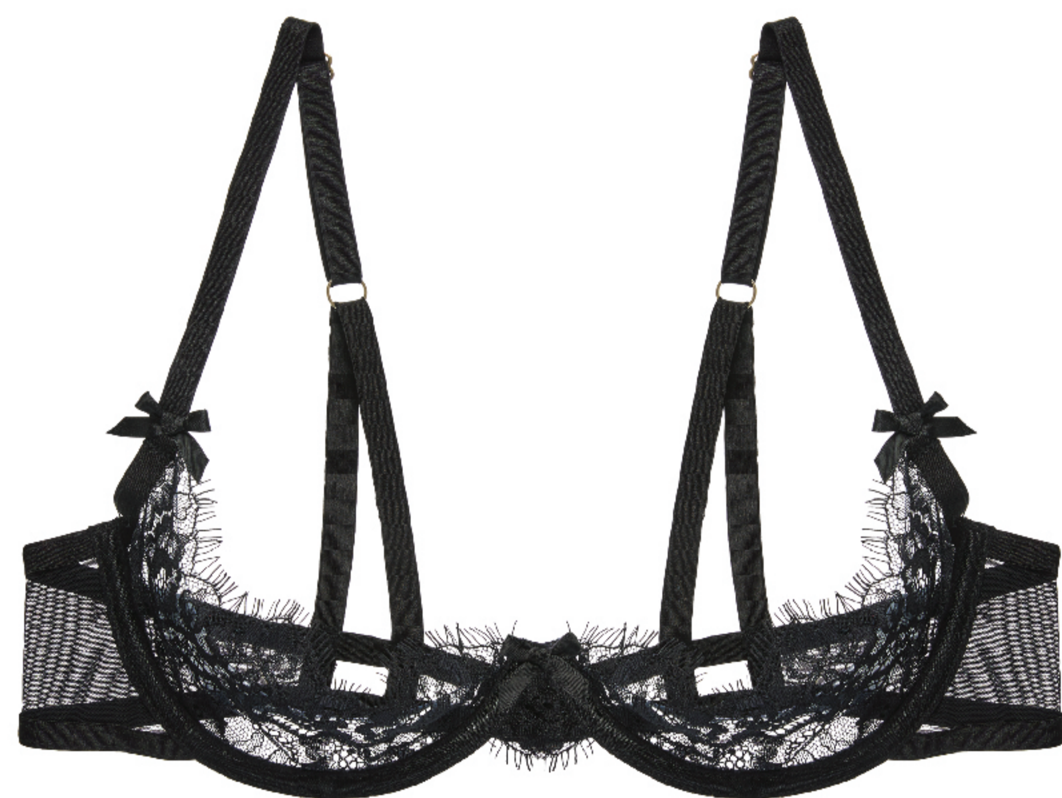
V59006 1/4 CUP UNDERWIRE BRA