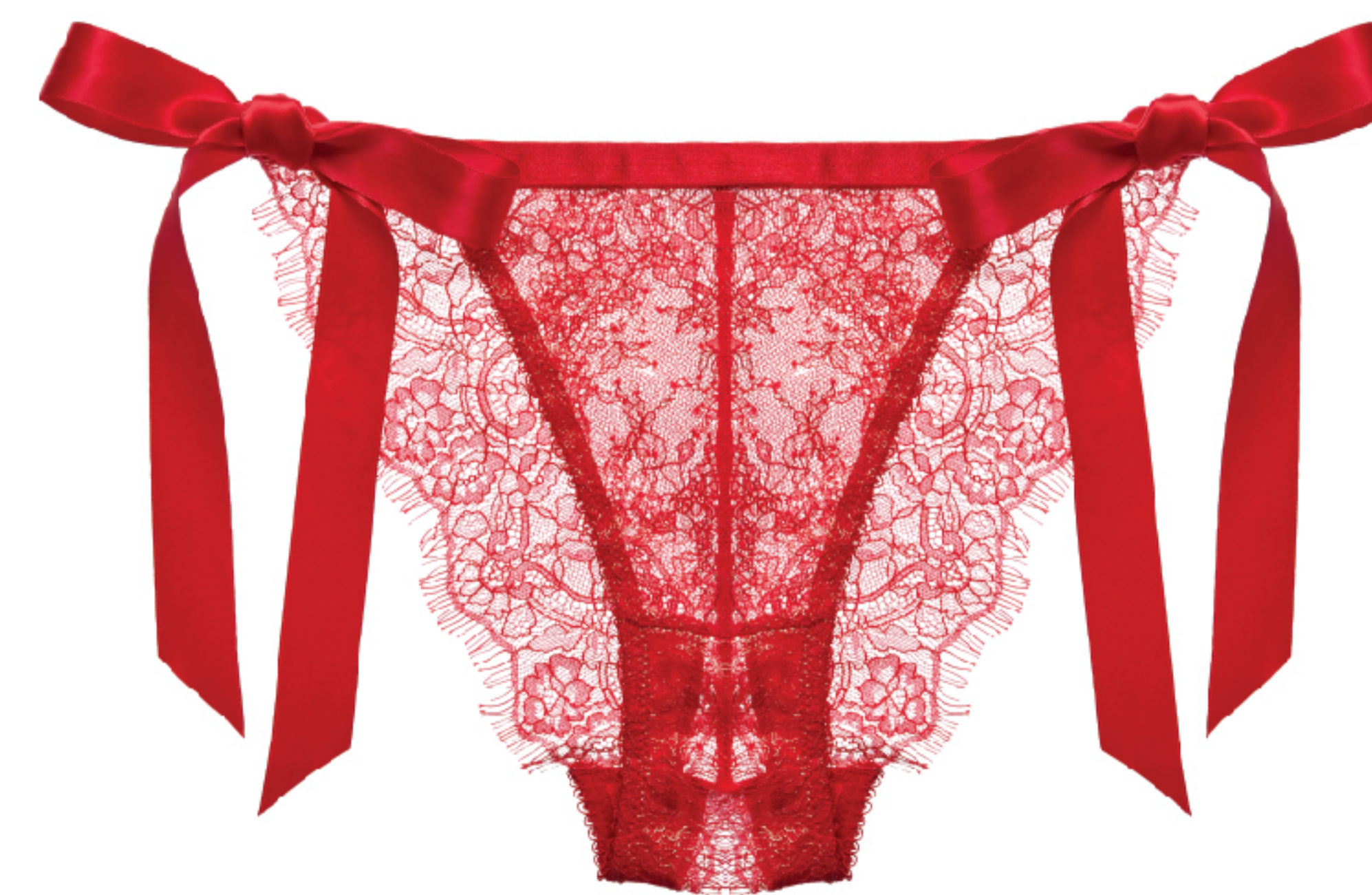
V22007 OPEN TIE SIDE BIKINI