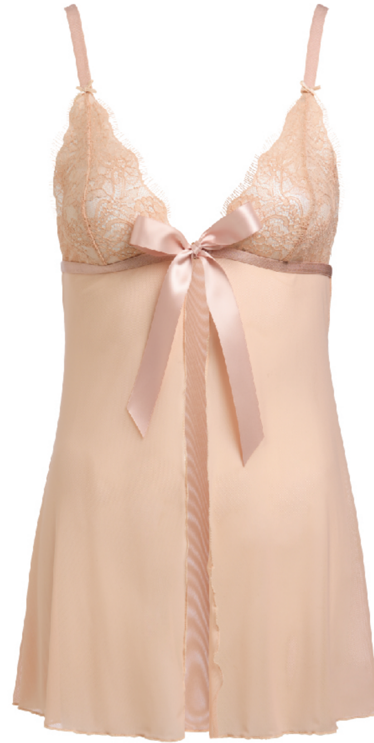
V32007 OPEN BABYDOLL