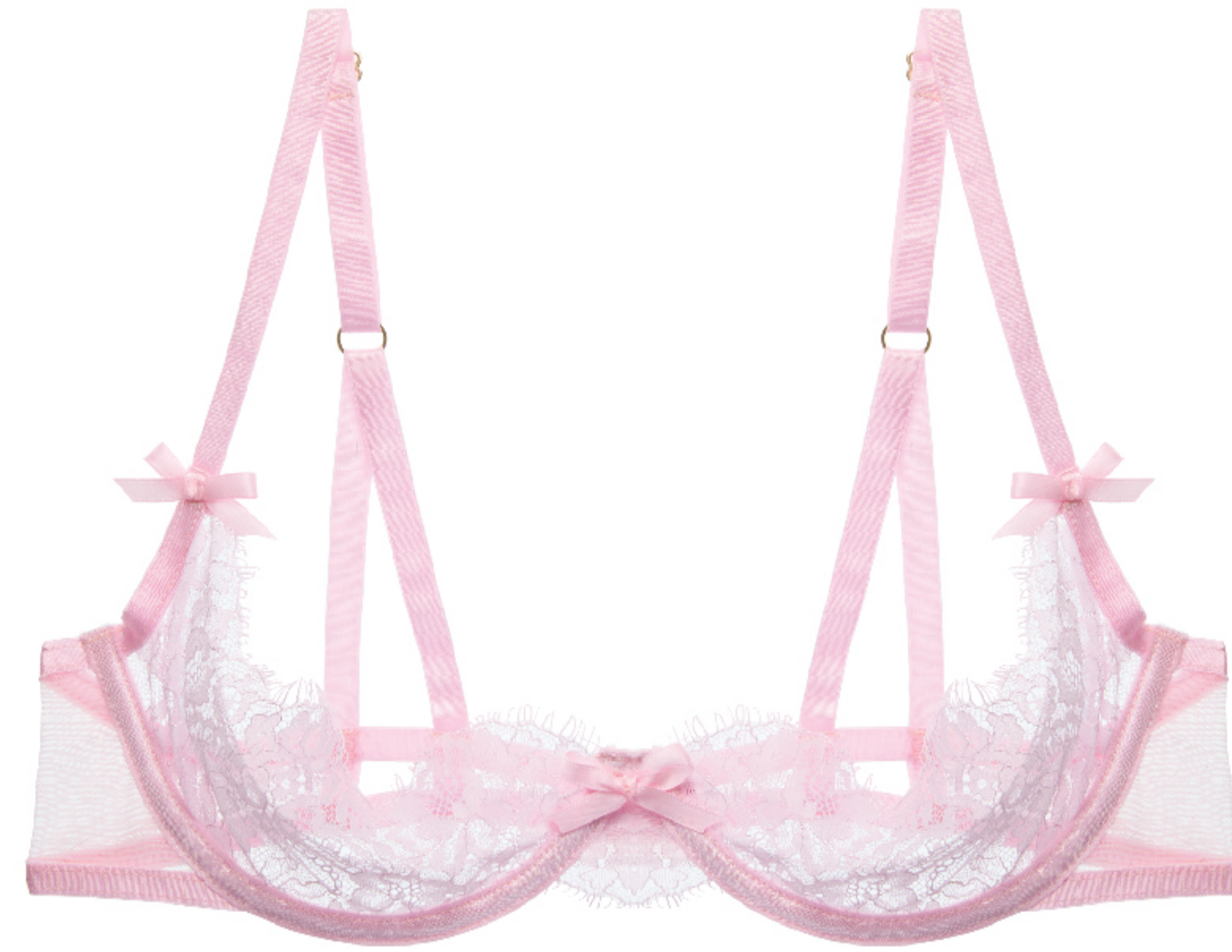
V59006 1/4 CUP UNDERWIRE BRA