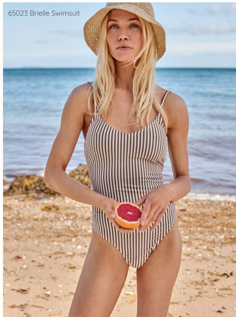
65023 Brielle Swimsuit

This is beachwear made for movement, made for softness, and made for you.