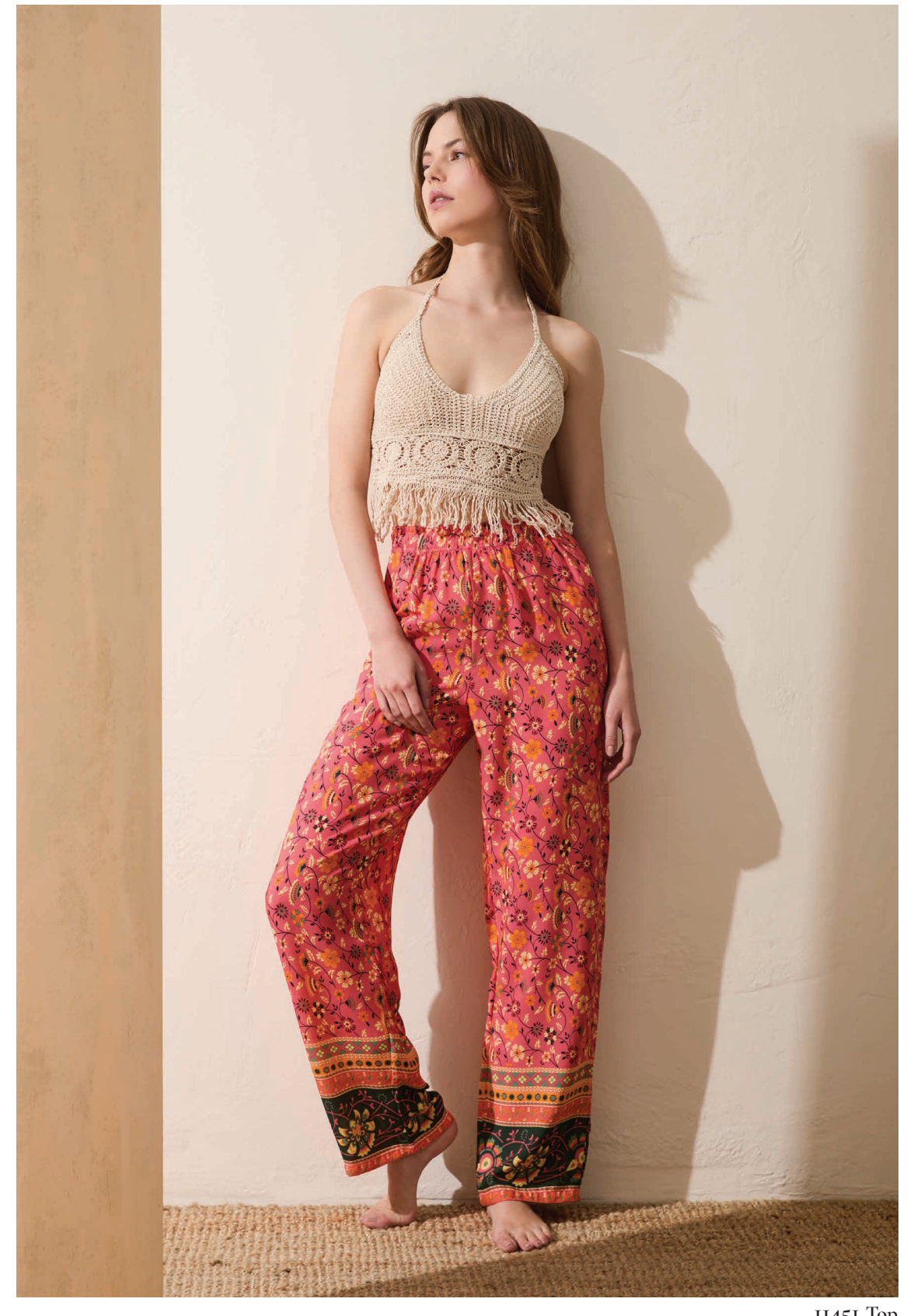
11451 Top 11494 Pants