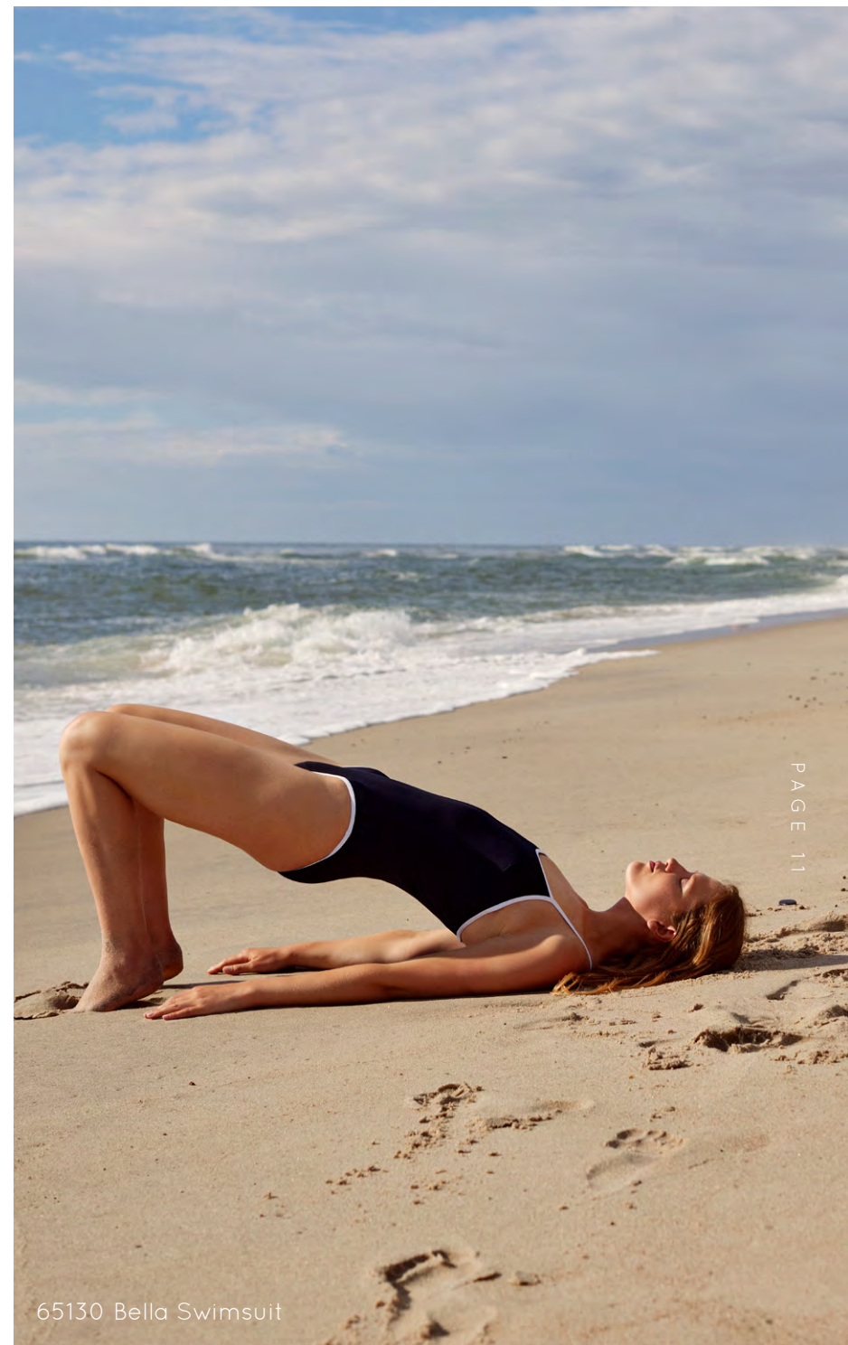
65130 Bella Swimsuit