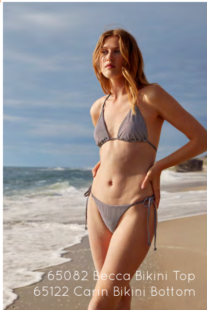
65082 Becca Bikini Top 65122 Carin Bikini Bottom