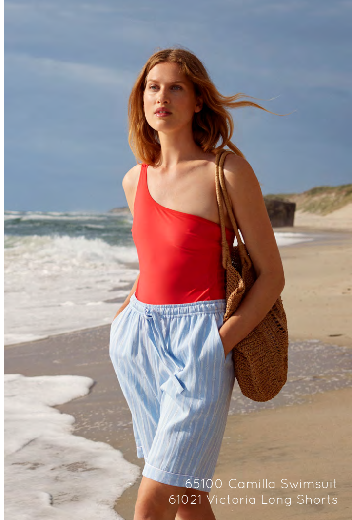
65100 Camilla Swimsuit 61021 Victoria Long Shorts