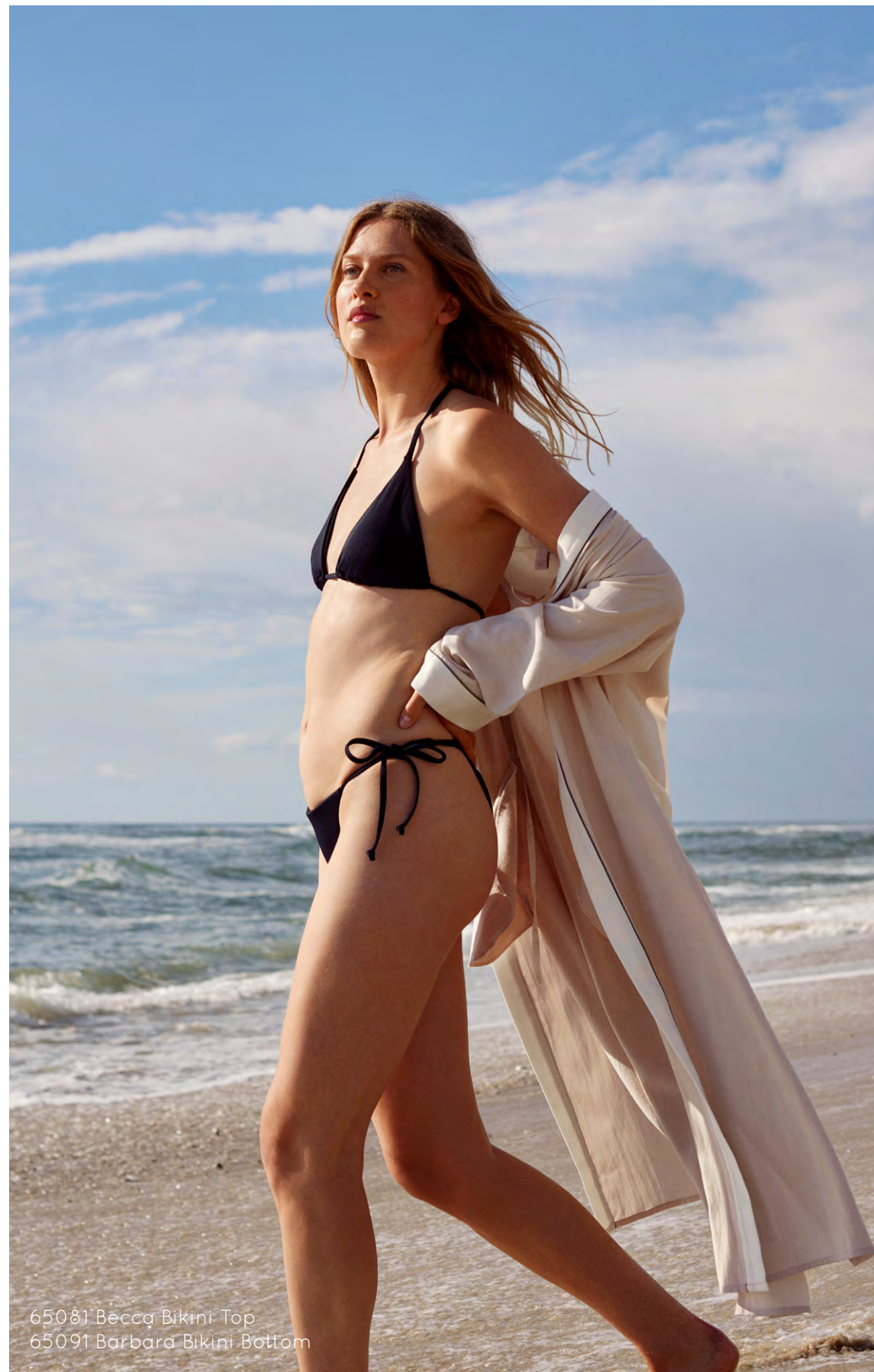
65081 Becca Bikini Top 65091 Barbara Bikini Bottom