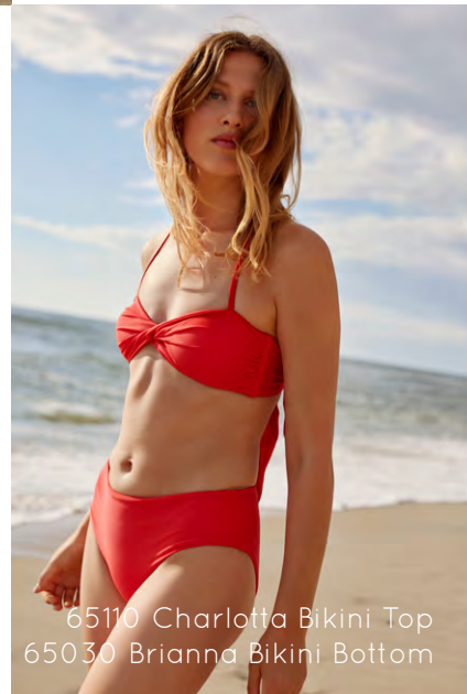
65110 Charlotta Bikini Top 65030 Brianna Bikini Bottom